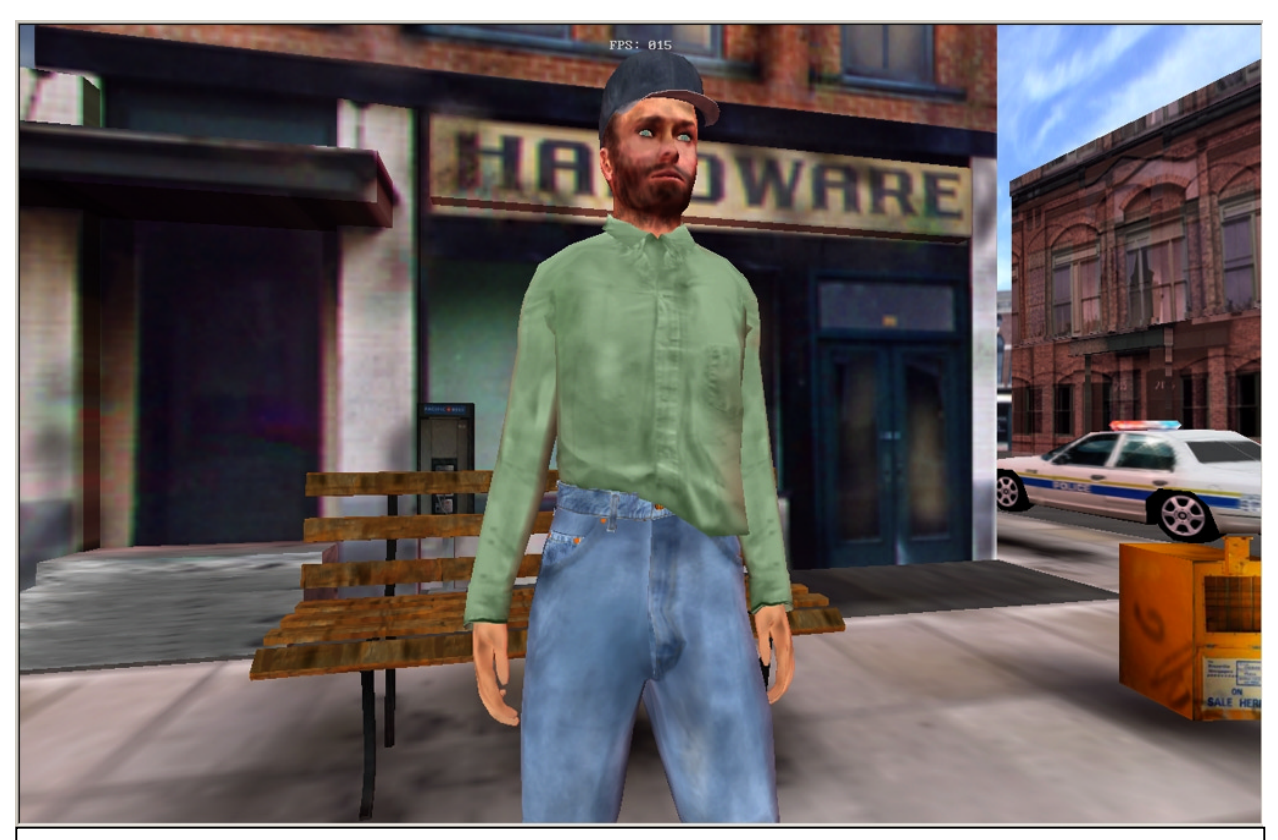
Figure 1: The JUST-TALK Virtual Environment

After the introduction, the student can then interview the subject. The interactions with the subject in this trainer are all verbal; this trainer does not teach apprehension techniques. Either the subject or the student may initiate the dialog. Sometimes the subject may be very withdrawn, so the student will have to open the conversation. Other times the subject may be very agitated and will start talking at the student from the start. The student uses the conversation to stabilize the situation, assess if the subject is anchored in reality, and determine what action is needed (i.e., leave, attempt an arrest, transport the subject to a mental health facility, or subdue the subject).